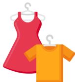
Gently worn clothing