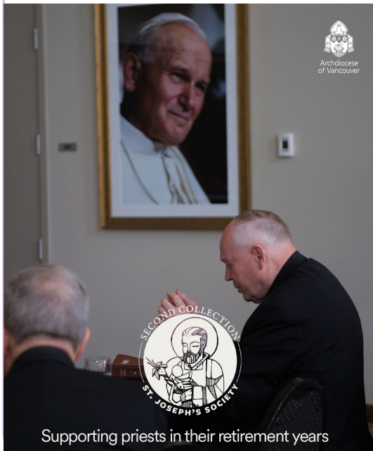
Supporting priests in their retirement years

This Sunday's second collection supports our retired priests who have dedicated their entire life to the Church. Your generous support ensures a comfortable living medical care, and other essential services for environment, quality our retired priests. You can make a tax-deductible donation to St. Joseph's Society in-person at the parish or online at rcav.org/joseph